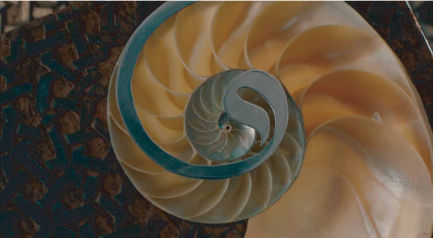
An example of mother-of-pearl usage in the craft