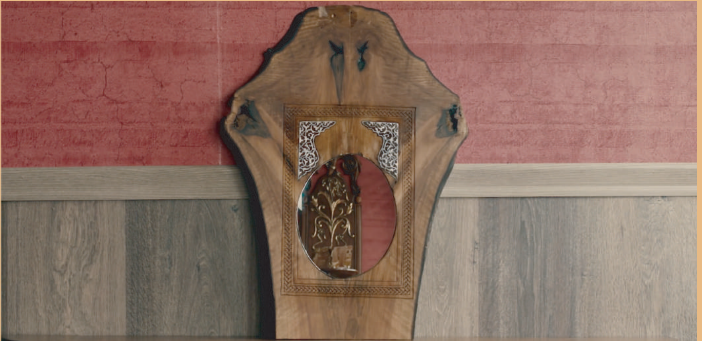
Final product: A mirror