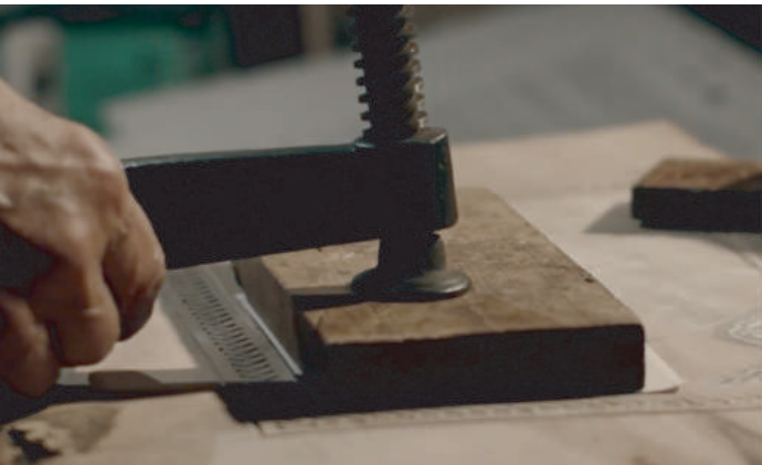
Using of pressing machine

9. Slotting the mother-of-pearl design into the groove